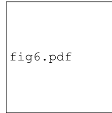
Fig. 2. Azimuthal velocity. The 2D fluid spontaneously evolves to this stationary state. No thermodynamics.