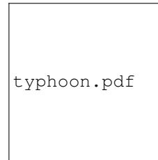
Fig. 4. Tropical cyclone

[NOTE the figures in JPG and in PDF format are in the ZIP archive NPG-2014-1-supplement.zip]