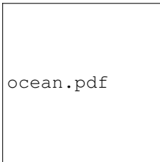
Fig. 3. Small-scale turbulent velocity field